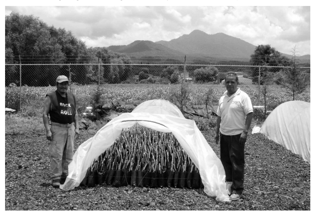
FIGURE 1 Mulberry tree seedlings: widely planted in highland Mexico in the 18th century as food for silkworms and now being reintroduced in many indigenous communities as part of a collective effort to promote silk production for incorporation in handicrafts, and increasing value of artisan production, while strengthening communal strategies.

informed by the insights of Eric Wolf (1982), whose work demonstrated that adaptive behavior is characteristic of the most successful "traditional" communities (Barkin and Lemus-Ruiz 2011).