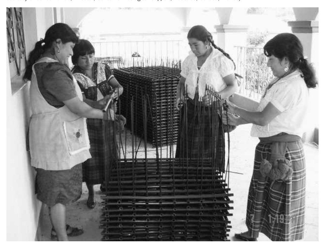
FIGURE 4 Women weaving the entrails of a community built and operated anaerobic wastewater treatment plant for recycling domestic effluents for further use for agricultural production on communal lands in a highland community in Ixtlán de Juárez, Sierra Norte, Oaxaca.