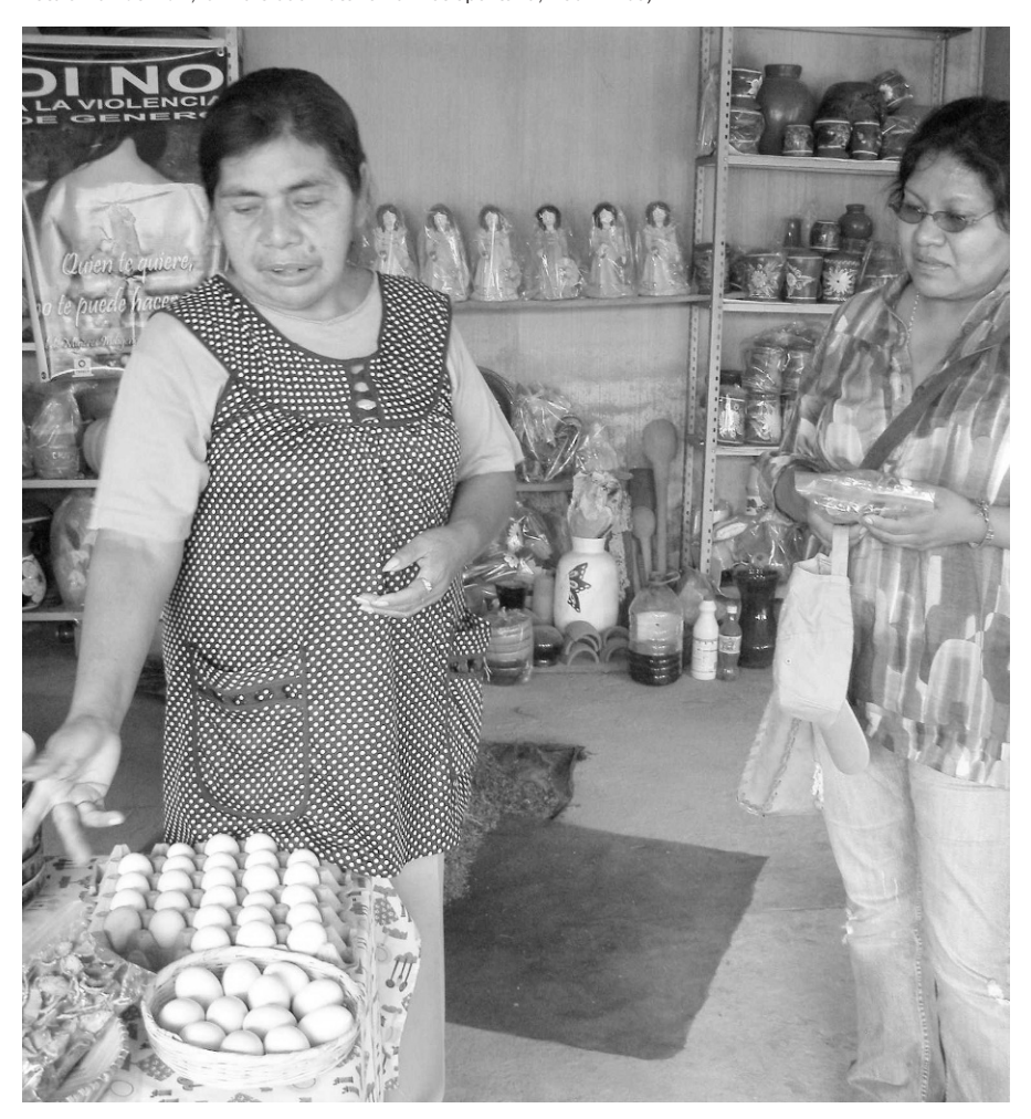
FIGURE 2 Community leaders involved in the search for new lines of production, providing new sources of employment and income based on the incorporation of local resources. In the photo the omega-3 eggs are featured along with handicrafts and a sign in the background pointing to a campaign against violence to women in which these women are active.

than that offered by the modernization discourse dominant in the North (Escobar 1995; Barkin 1998; Harris 2000; Toledo 2000). The more successful of these proposals are designed from the local point of view, where the inhabitants become the protagonists of the recovery and preservation of their resources.